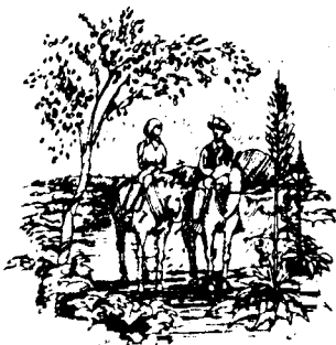
Trail riding in the foothills

Wood siding, stucco and wood trim • Concrete tile roofs